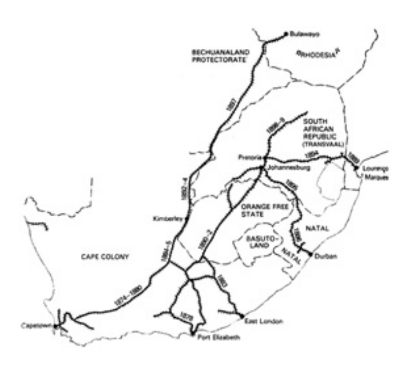
A map of the railways of Southern Africa by 1899.