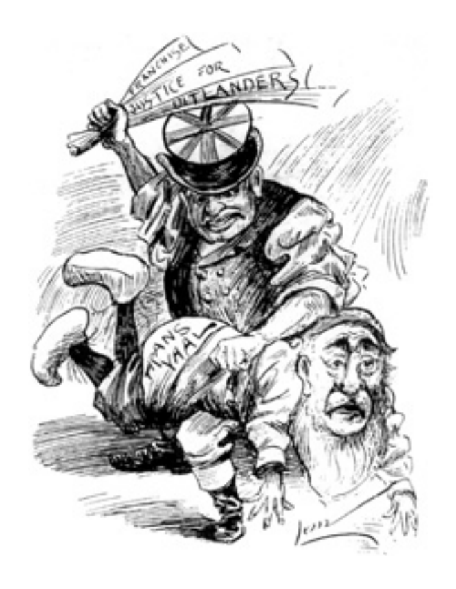
A cartoon from a British newspaper, 1899.